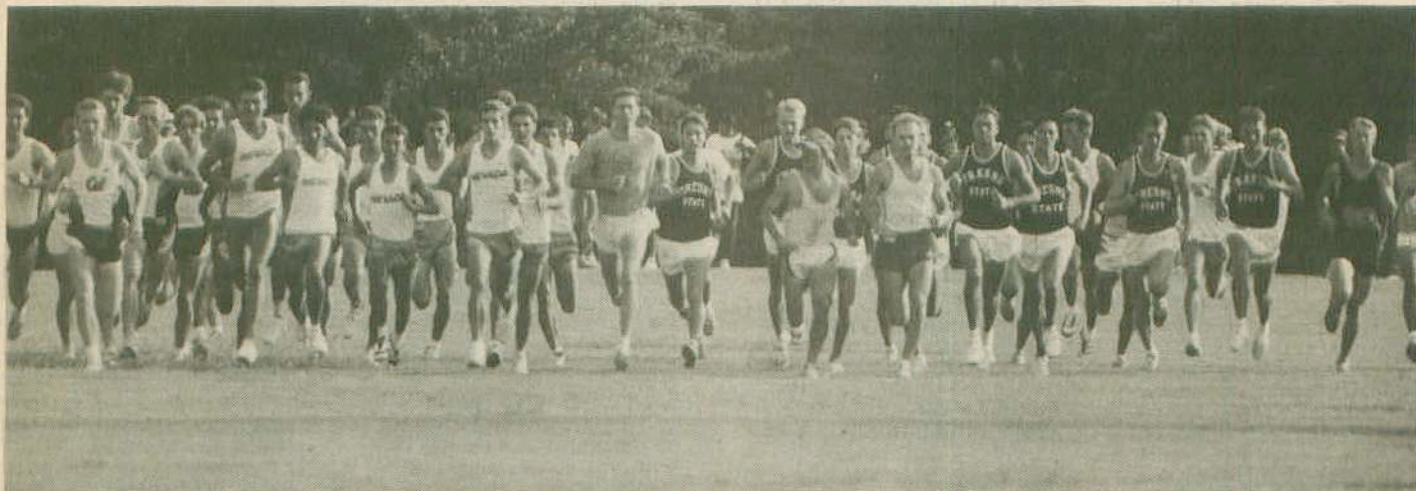
Start of men's race at Fresno State X-C Invitational—California, Nevada, Fresno State and UC Riverside.