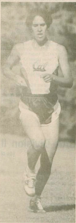
JANET BOWIE

Men's Results - 5.15 Mile Team Scores: 1. Humboldt State 20, 2. Chico State 50, 3. Stanislaus State 72.