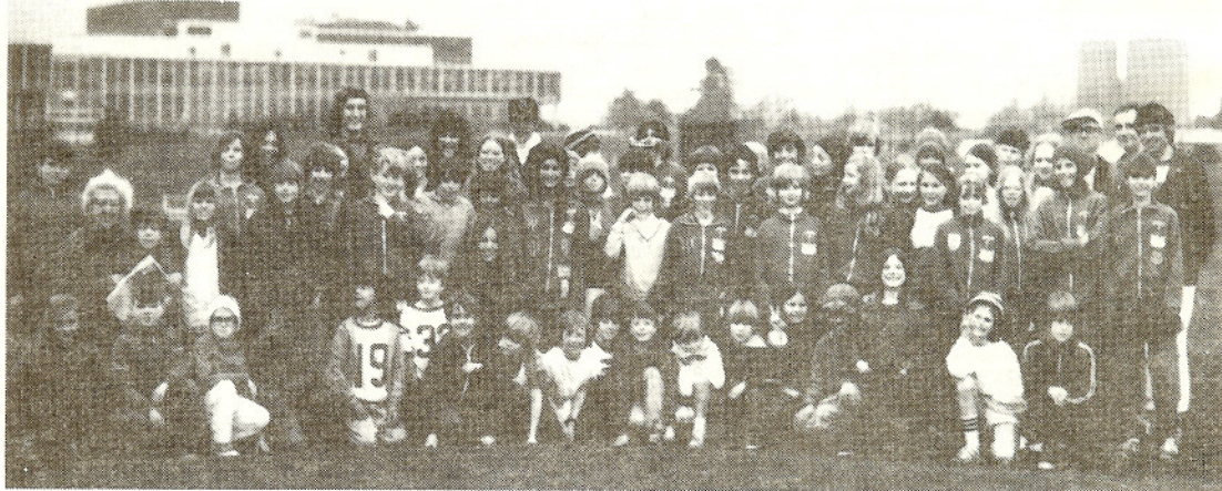
This happy group is just a part of the 150 members of Portland Track Club Age Groupers.