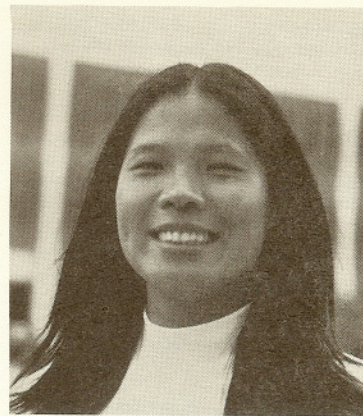
CHI CHENG

CHI CHENG has returned to the Republic of China where she underwent an operation in mid-August to alleviate the pain in her right hip. This is the same operation which was necessary in 1972 on her left side in which some 9" of muscle was removed from the tensia facinata requiring 52 days of hospitalization. Over the past three months, the pain has grown so severe and was constantly present whether she was sitting, walking or running that the operation was decided upon. It is not known at this time if she will be able to run again or not. The purpose of the operation is the relief of pain.