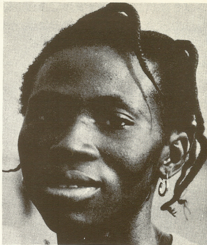
MODUPE OSHIKOYA, Nigeria, winner of both jumps at the African Championships with marks of 5'7 and 20'2.