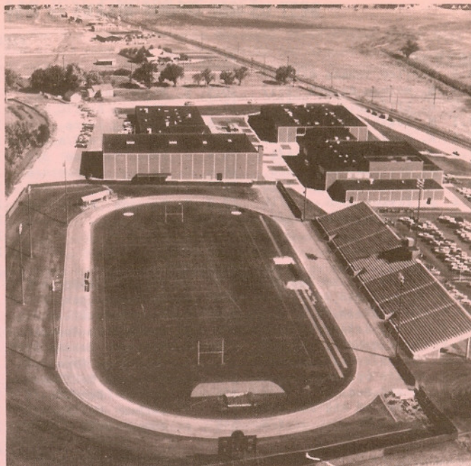
Site of National Championships

WTFW will keep you informed of developments for this important National Championships.