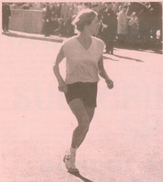
Roberta Gibb finishing Boston Marathon in 3 hours 35 minutes. This was Roberta's third Boston marathon.