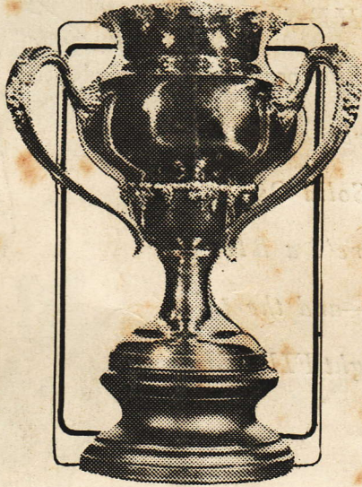
Hearst Perpetual Trophy