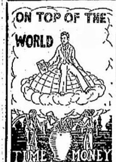
"On Top of the World"—is the feeling...