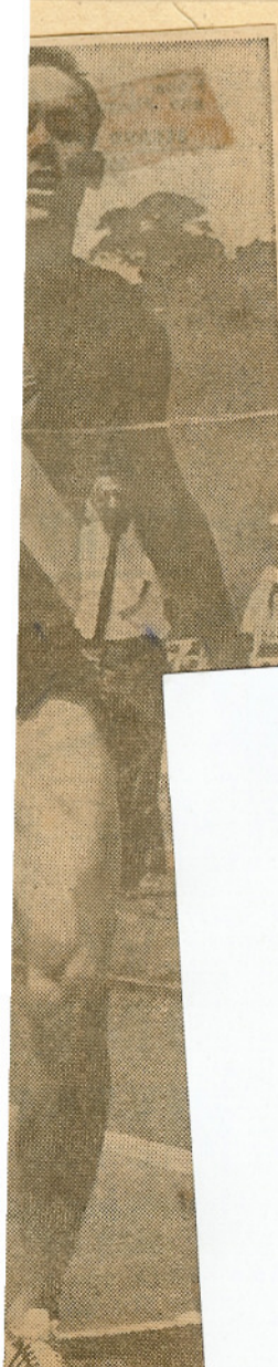
r 880 sensation 50.9 during Stat esterday. He br

A crowd of more than 3,000 fans watched the trials. More than 15,000 fans were expected at the finals today.