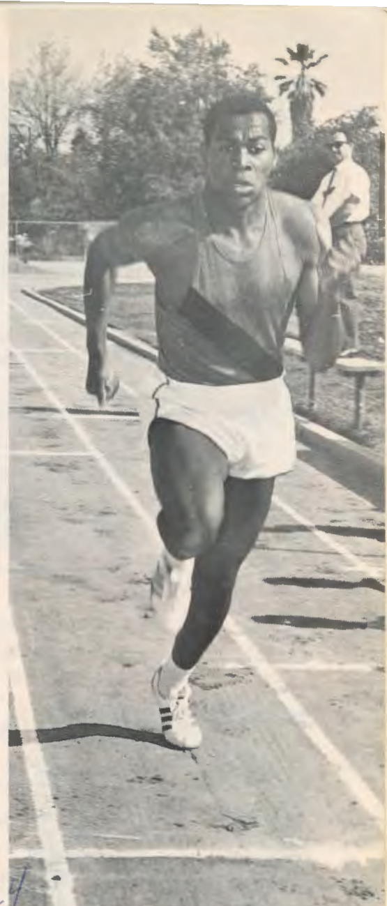
Lee Evans, Overfelt, San Jose, 46.9

Entrants Trials Order No. Mark Name and School Place Time