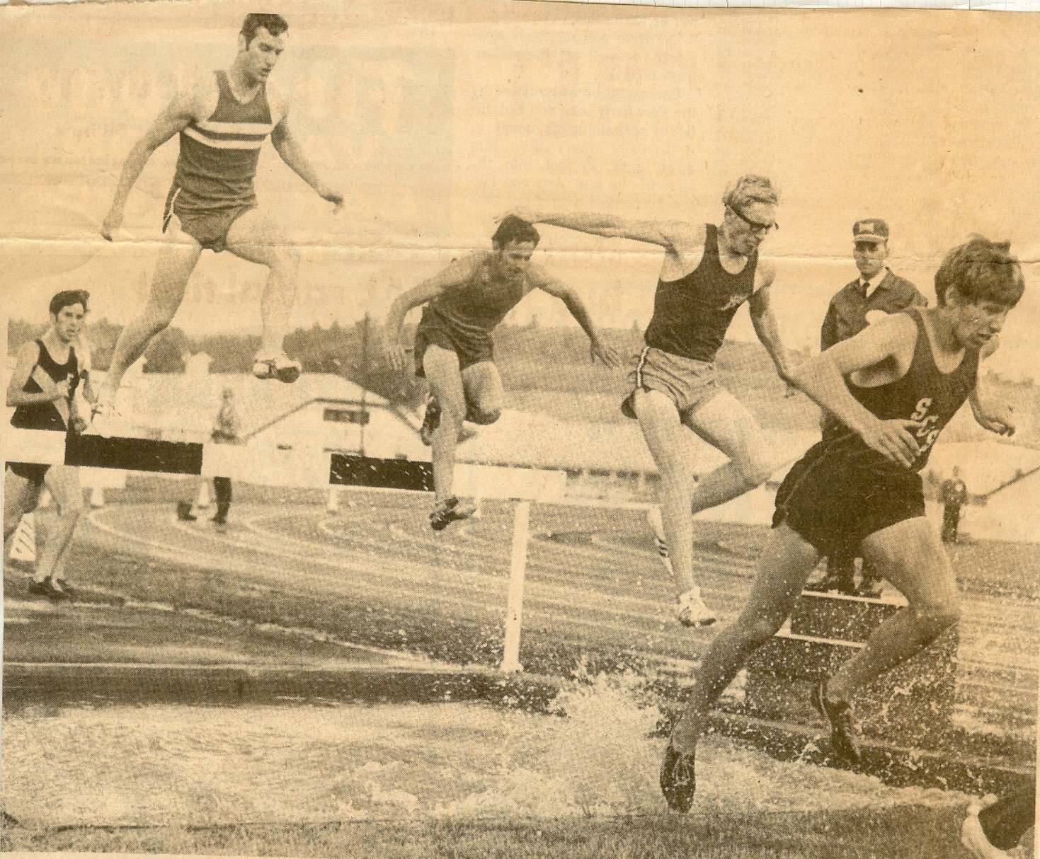
A sequence in one picture of the steeplechase Friday afternoon