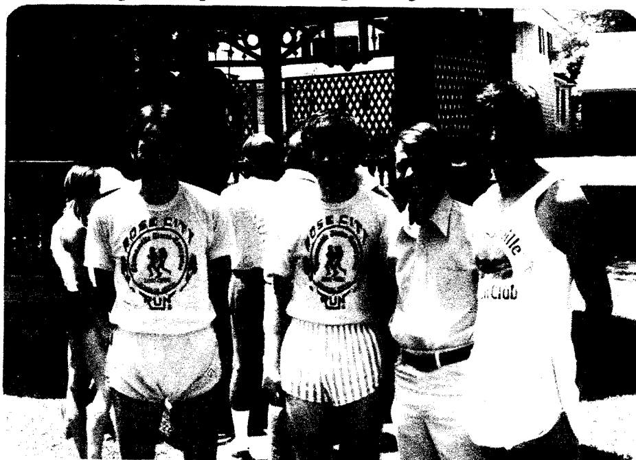
Team trophy winners at Thomasville

We swept through town over its cobblestones, turned onto a major highway with a whole lane coned off just for us and passed beds and beds of roses. The course described a rough square, with the finish in about the same place, at the grassy park. On the "backstretch" the