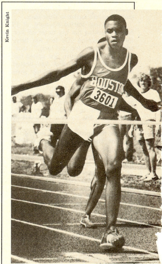
The prep long jump recordholder, Carl Lewis showed at the SWC that he is a new sprint threat too.