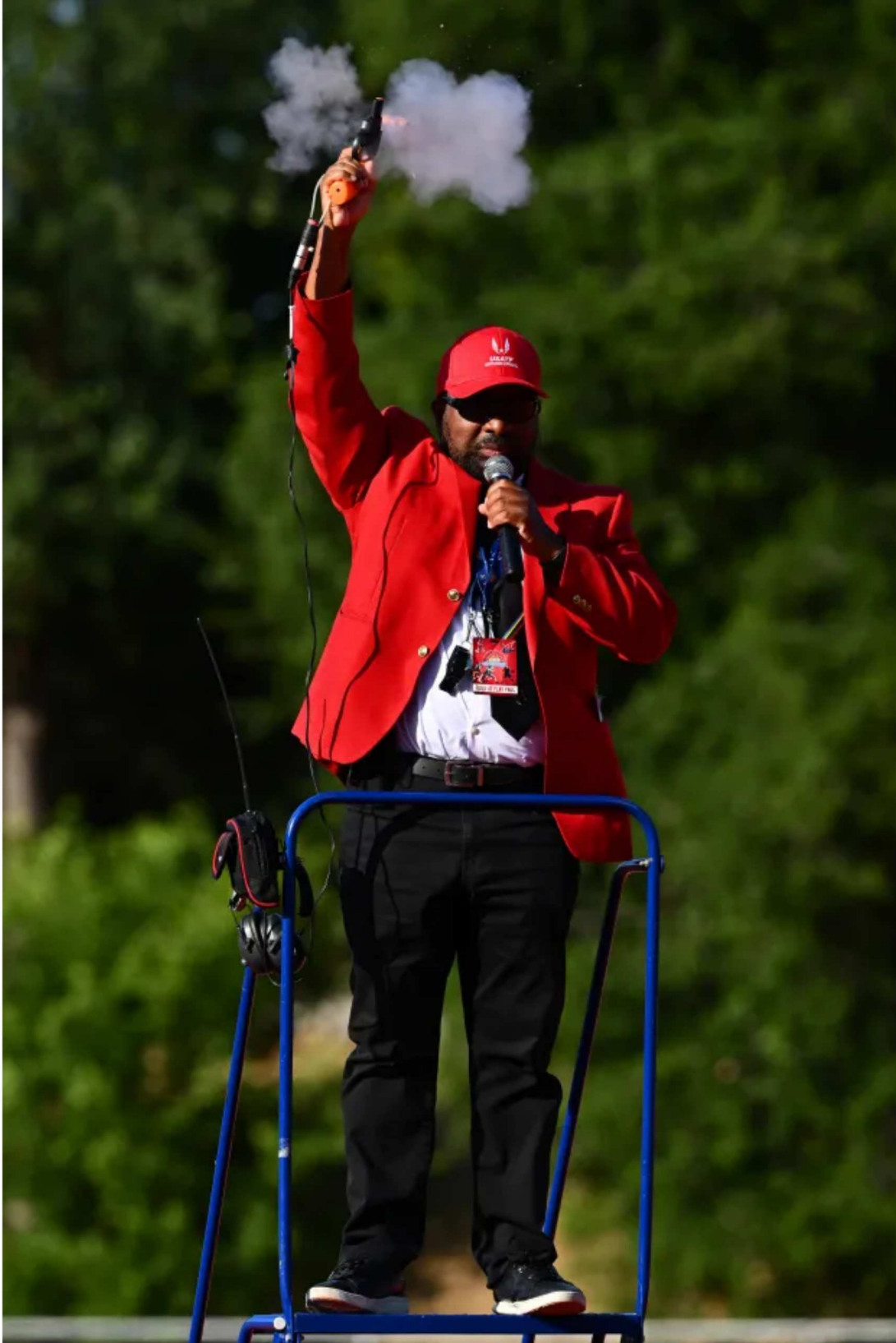
A track official fires his starter pistol during the Boys 400 Meter Dash at the CCS track and field championships at Gilroy High School in Gilroy, Calif., on Saturday, May 18, 2024.