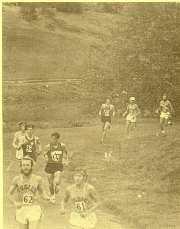
Aggies in action during Cal Aggie Invitational.