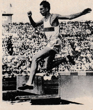
THE MOST CONTROVERSIAL PICTURE OF THE YEAR

Vladimir Kazantsev (U.S.S.R.) is here seen in process of shattering the previous world's best time for the 3,000 metres steeplechase at Moscow on July 10th 1951. His 8:49.8 beat the former best performance of Erik Elmsäter (Sweden) by a margin of 9.8secs. In the opinion of Chief Coach Dyson the barriers appear to be less than the standard 3 feet in height. The wearing of socks in an event involving 7 water-jumps is puzzling ✓