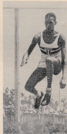
The first picture ever published in this country of the 10st.3lb. Brazilian A.F. da Silva, 24, who was the only man in 1951 to better a World mark in a standard event.