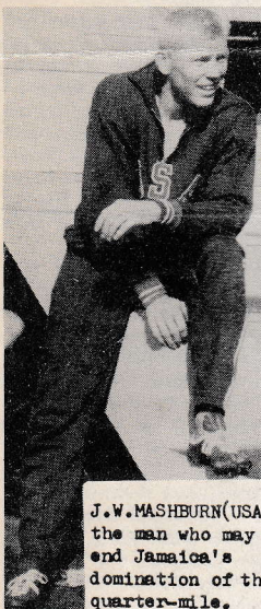
J.W. MASHBURN (USA) the man who may end Jamaica's domination of the quarter-mile.

The major upset came in the 440 yards in which the 1,600 metre Helsinki relay reserve J.W. Mashburn served notice on the world that he is a coming great and that the Jamaican domination of the event looks like waning. The tow-haired husky never gave George Rhoden a chance in a driving finish which left the Olympic Champion 5 yards in rear as he broke the tape in 46.8 secs. for the 10th spot on the all-time quarter-mile list.