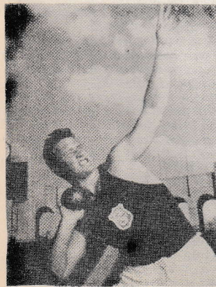
Five times over 58 feet, then 59' 0 3 / 4 " (18.002) - W. PARRY O'BRIEN (U.S.A.) of Irish descent.