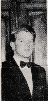
Rieff: "Incroyable" Mimoun: "Magnifique" "When running interferes with living a normal life it's time to pack it in" -Chataway.

The star turn was Oxford's 22 years old Chris. Chataway in the two miles event which, temporarily, was graced by the world record holder (8:40.4) Gaston Rieff of Belgium and throughout by Gordon Pirie and Alain "Tourjours Argent" Mimoun.