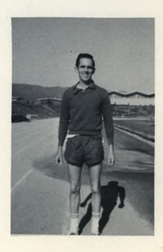
Carl Martin Relay