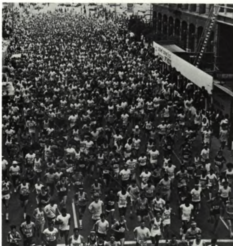
The mass start (or part of it) of the Bay-to-Breakers Race, with 2585 starters.