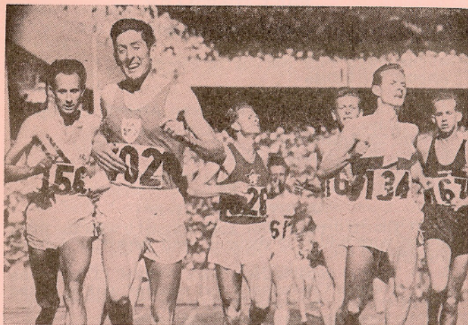
Ron Delany of Ireland, here winning the Olympic Games, and Stanislav Jungwirth (third from left), new world's record holder, will be among a star studded metric-mile field at Stockholm.

there is even time for an air hop to Finland, or to the unique northlands of Europe. . . .