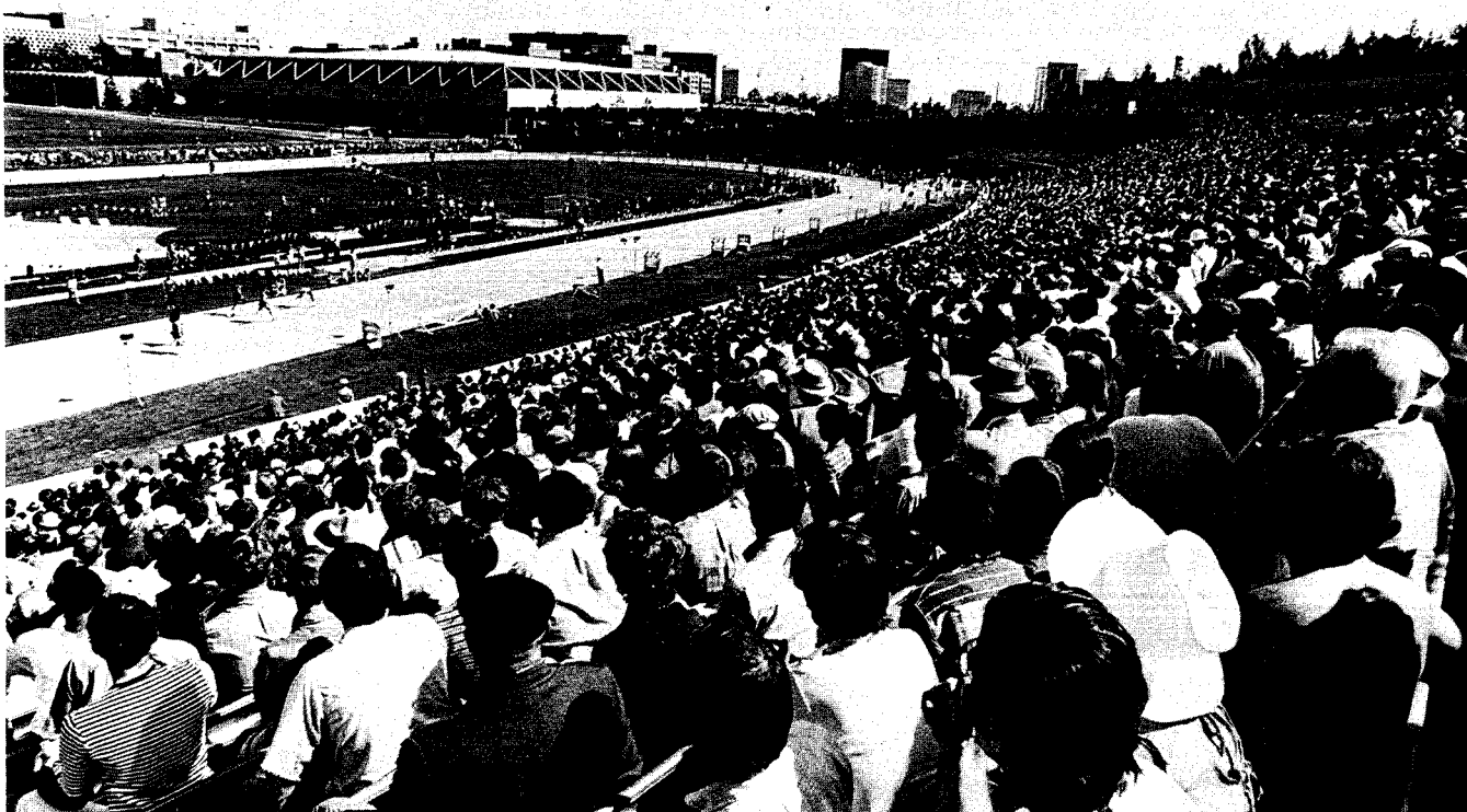
Looking South with 12,343 fans at April 10th Pac-8 doubleheader here in The Stadium. Note "fence watchers" on East side of field.