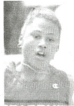
Marion Jones #1 in 3 Events -- 100, 200 and Long Jump