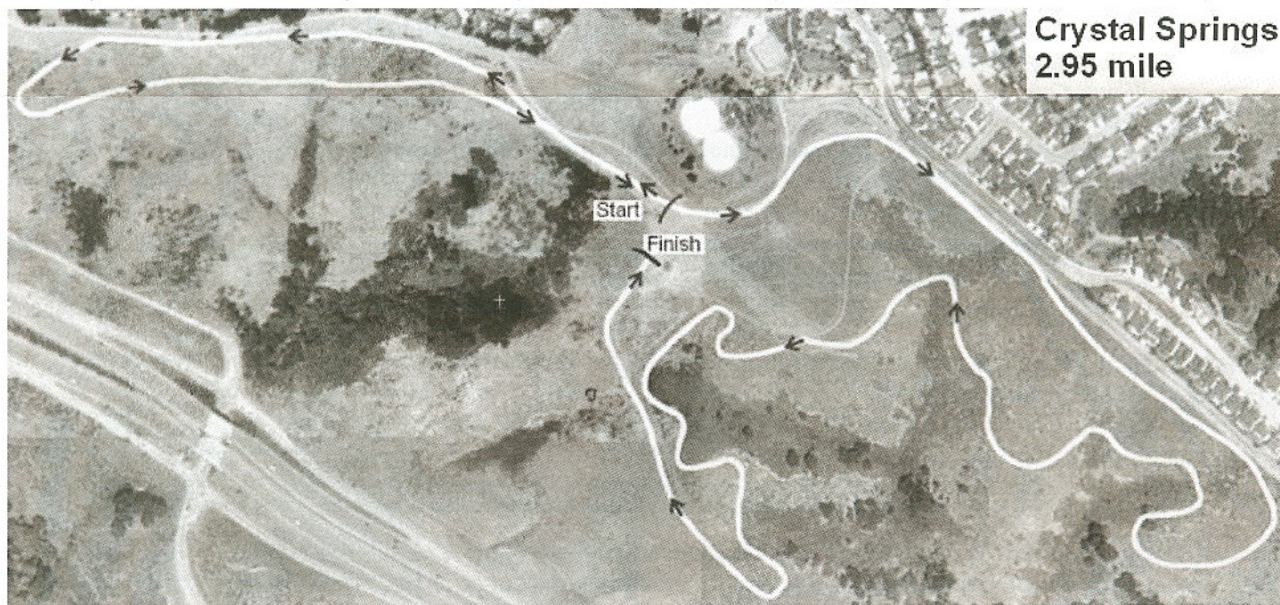
Borrowed from the Lynbrook.com site