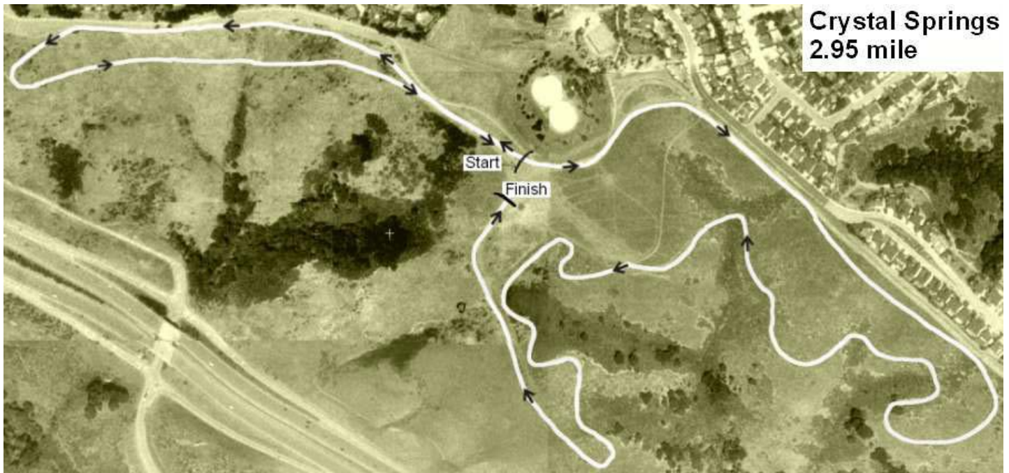
Borrowed from the Lynbrook.com site