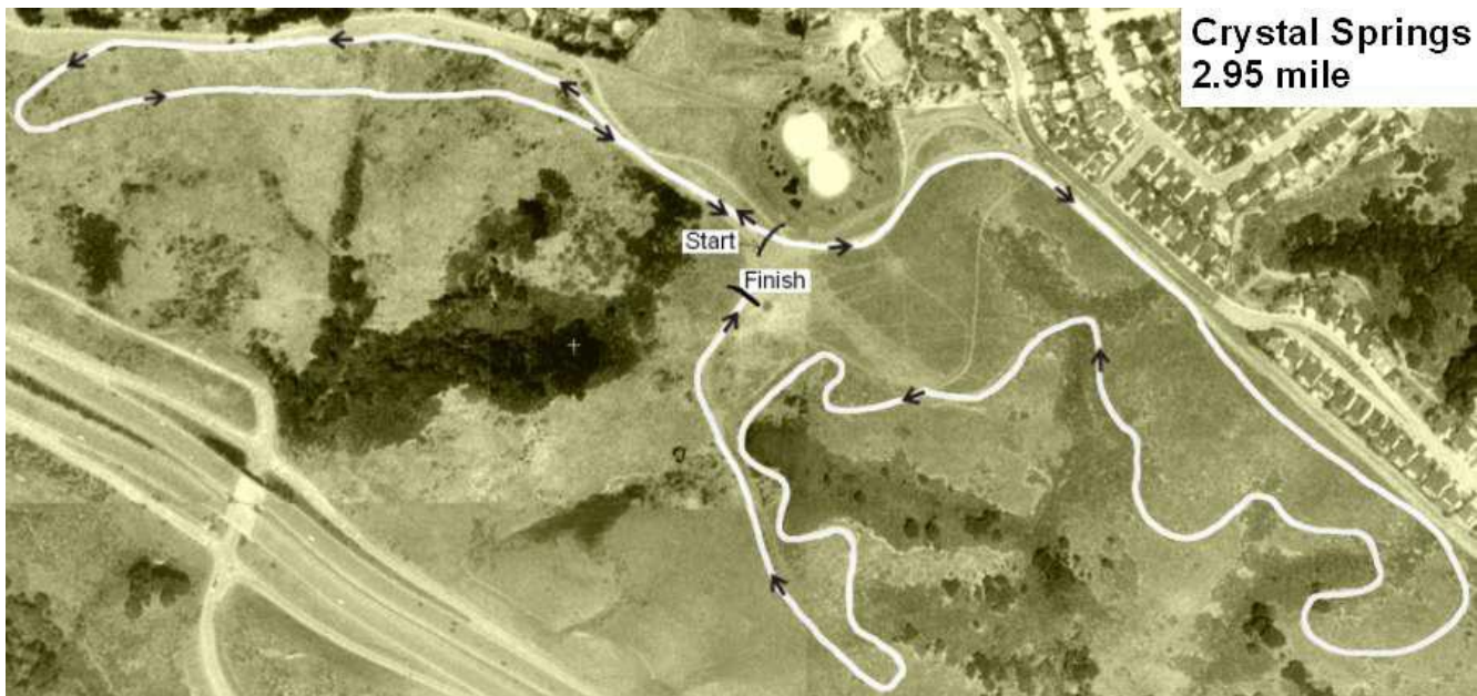
Borrowed from the Lynbrook.com site

The Freshmen and Sophomore boys are separated in order to give us a field size we can manage...as are the varsity and JC girls . If the number of entries indicates freshmen and sophomore boys, or varsity and JV girls, should run together in order to make a competitive race, you will receive an e-mail and the race will be run at the time for the sophomore boys or the varsity girls.