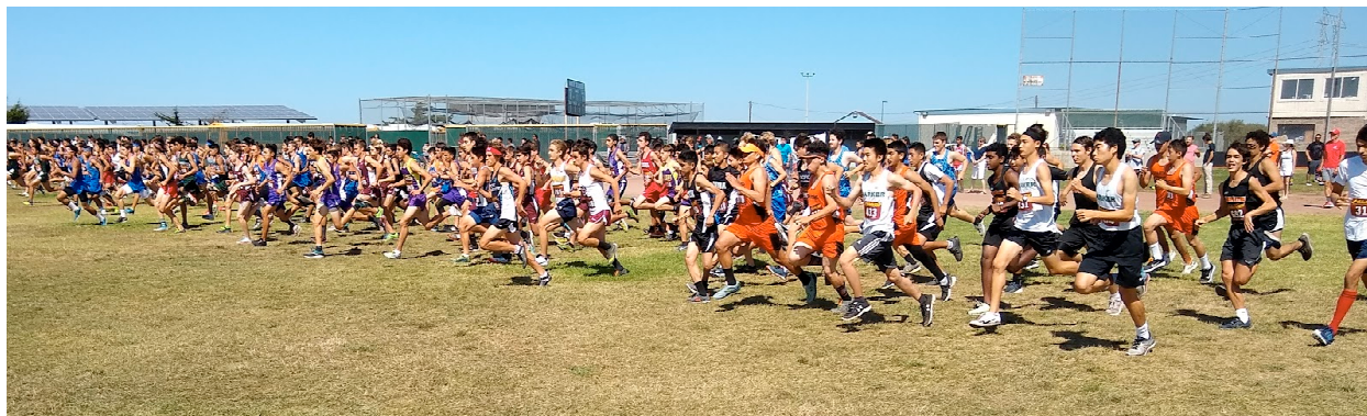
Frosh/Soph Boys Largest Race of the day with 322 finishers!

A clear sunny sky with mild temperatures and a full moon welcomed everyone to the 2nd Annual Jackie Henderson Memorial Cross Country Invitational on Saturday, September 14th at North Monterey County High School in Castroville. Soaring temperatures had gripped the region in the days leading up the event but shifting off shore winds made for a perfect meet day with temperatures in the 60's and 70's. All 50 teams who had traveled from the heat were very pleased.