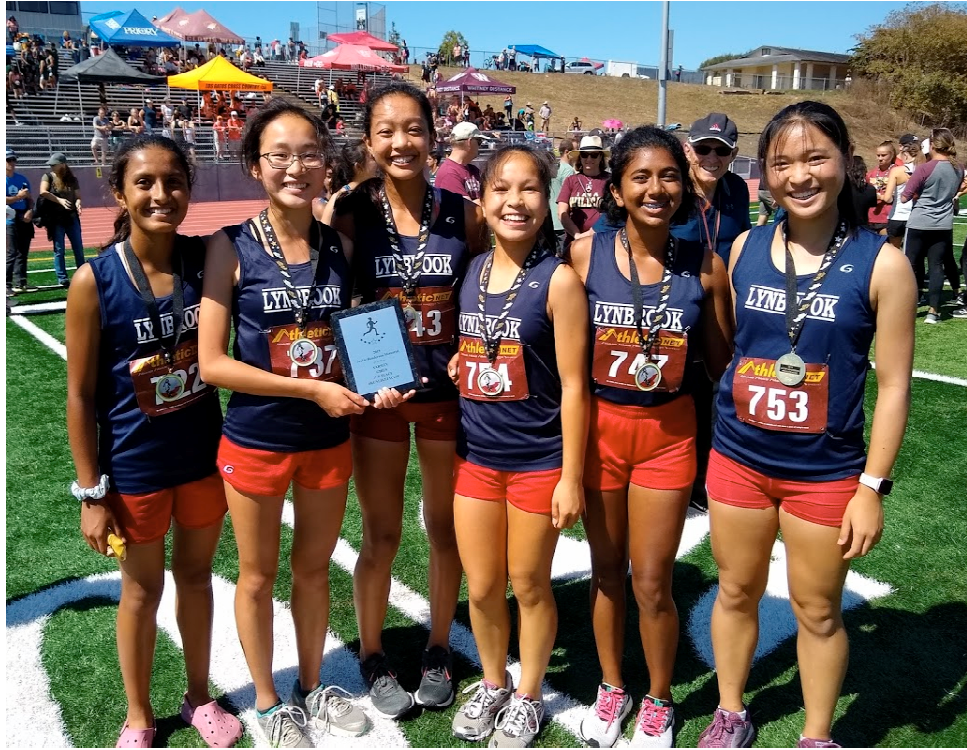
Lynbrook 2nd Place Varsity