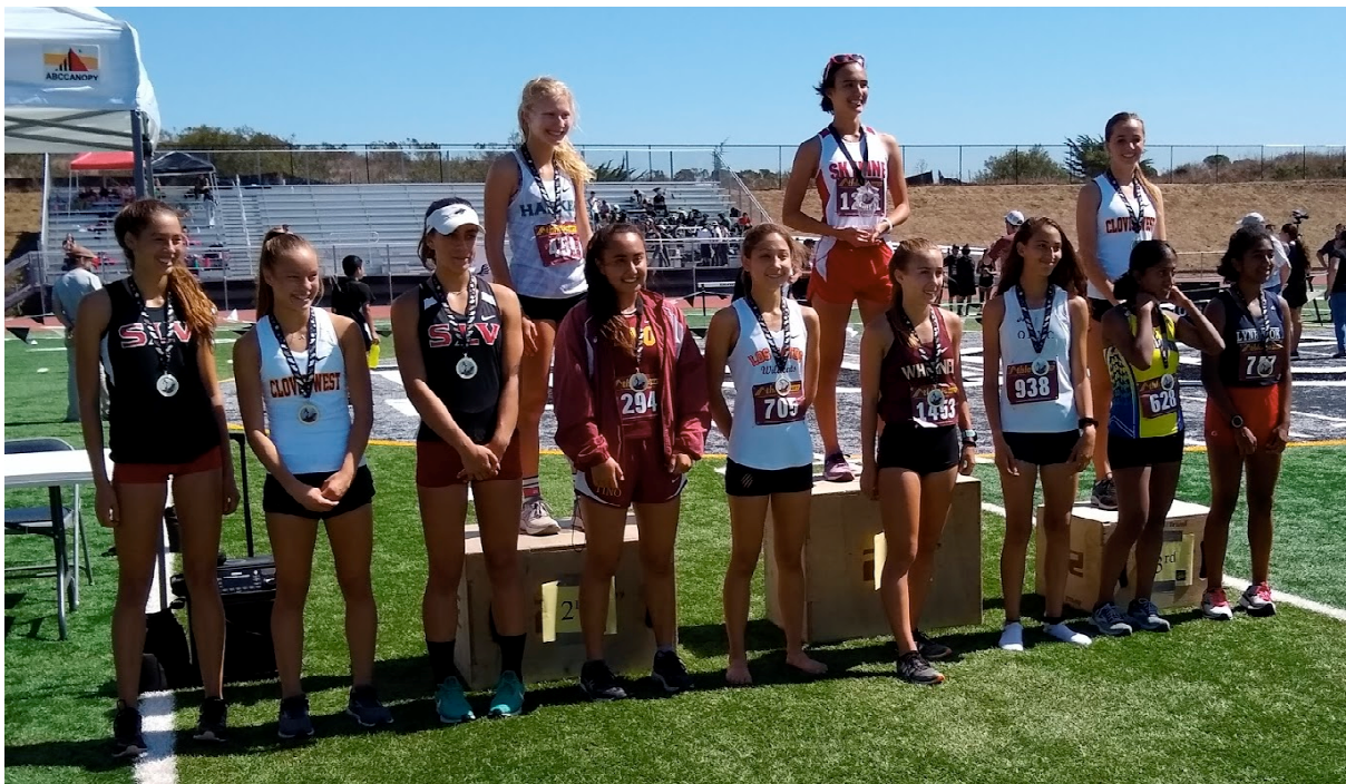
Varsity Girls Medalists