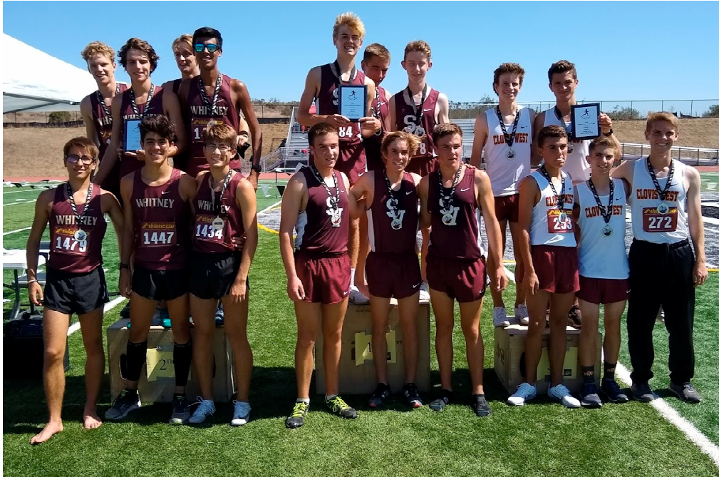
Whitney (2nd), Scotts Valley (1st), Clovis West (3rd) Varsity Boys

We knew the boys would bring the team heat and they didn't disappoint. Clovis West was our pre-meet favorite and would have probably sealed the deal here but had to run a bit short-handed with 3 of their top guys sitting this one out after some nasty spills in a pile-up at their previous race. That opened the door just slightly and allowed Scotts Valley to pound it in! Spear-headed by a lethal 1-2 punch they delivered a very tight 83-86 win over a sharp looking Whitney squad! Scotts Valley stormed to a 79:51 team time knocking 1:31 off a solid King City course record from last year . With those types of times (15:58 average!) look for Scotts Valley to mix it up at State in D4! Also keep an eye on Whitney as they were in cruise mode preparing for a league contest this week. Even short-handed, Clovis West was only 8 points back of Whitney and delivered the thrilling team battle we expected. Watch out later as they bring back their full crew! Once again, like the ladies, the top 3 teams came from 3 different sections with the CCS taking top honors here with SJ and CS 2nd and 3rd. Rounding out the top 10 were King City, Lynbrook, Santa Teresa, Salinas, San Lorenzo Valley, Leland, and Woodside Priory .