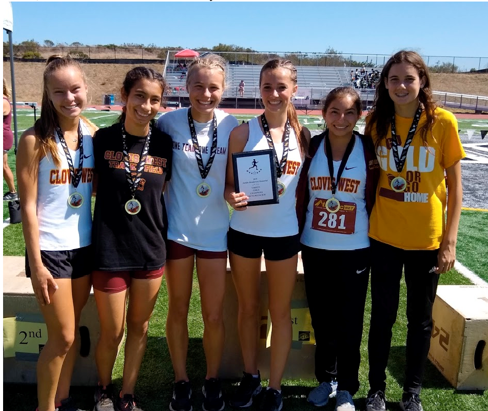
Clovis West 1st Place Varsity 95:57 New Course Record