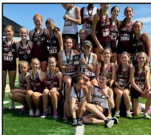
Scotts Valley 3rd (97 pts-95:13), St. Francis 1st (35 pts-90:17), Whitney 2nd (39 pts-90:04) New team-time course record by Whitney (90:04)

On the team front, St Francis (Mountain View) was here for the first time and boasted a veteran line-up which placed 3rd at state last year and may move up that podium this year! They added a key 9th grader up-front making them a force in 2023. They were out fast with a strong pack of 4 girls in the top 6 and sent a message early on that they were going for it. They held a massive team lead in the first mile but we knew Whitney, who had a more conservative start, had a squad that would make it a tight finish by 3 miles. Sure enough, Whitney moved up throughout the second half of the race and made it a very exciting close finish which we had expected. Early on when results were first posted it showed a 35-35 tie! Teams score 5 runners each with tie breakers going to the 6th runner. Whitney, we thought, had pulled off the win with a better 6th runner. Right before the awards were announced, it was brought to our attention that St. Francis' 4th runner was not in the results. Upon further review, a timing chip malfunction was the cause. Inserting her back into the results showed the true result, a tight 35-39 win for St. Francis! A Whitney coach also knew the outcome as