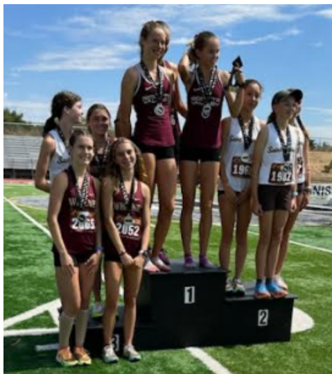
Girls Varsity Top 10